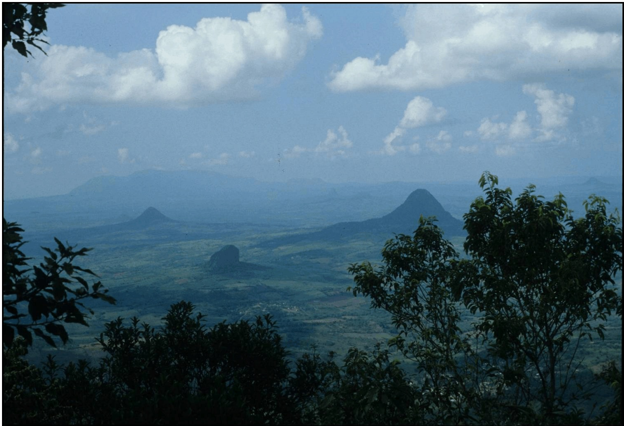
Nahua sacred precinct of Chicontepepec, Veracruz.